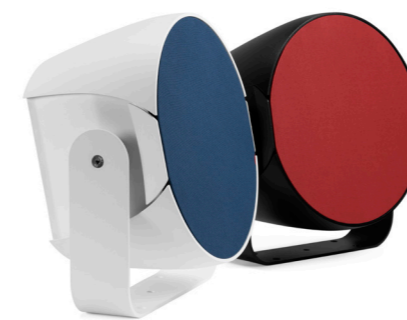
Possible color options

Although they meet all of the stringent technical requirements of the CarmenCita system, thanks to their compact shape and customization options, the speakers can also adapt to the aesthetic requirements of your performance venue.